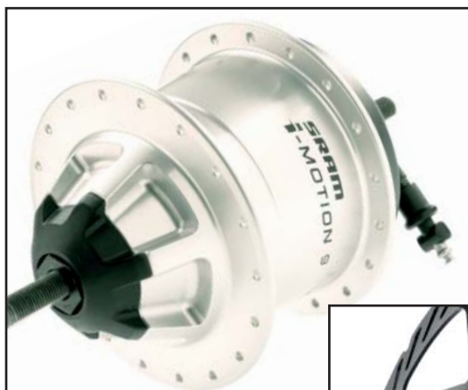
i-MOTION 9 freewheel

Sportive cycling with SRAM i-MOTION 9 freewheel/disc brake and SRAM i-LIGHT D7 series