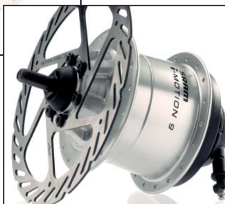
i-MOTION 9 disc brake