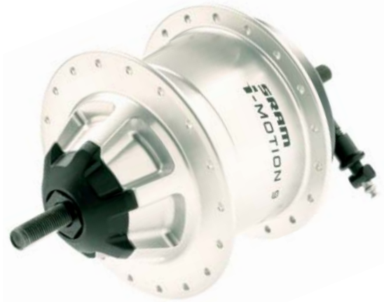
i-MOTION 9 freewheel

i-MOTION 9 is available as a freewheel, disc brake, coaster brake and i-BRAKE version.