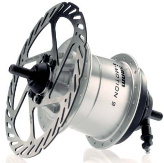
i-MOTION 9 disc brake