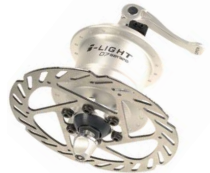
SRAM i-LIGHT D7 series disc brake