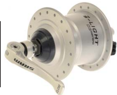
SRAM i-LIGHT D3 series