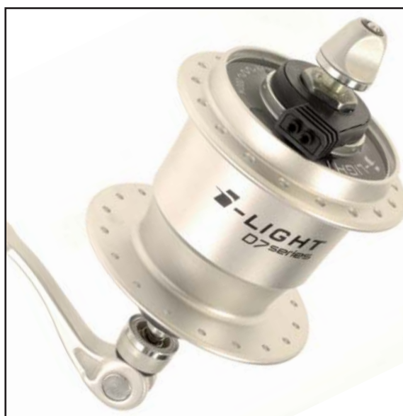
SRAM i-LIGHT D7 series