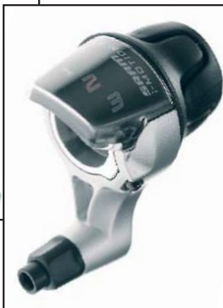
i-MOTION 3 shifter