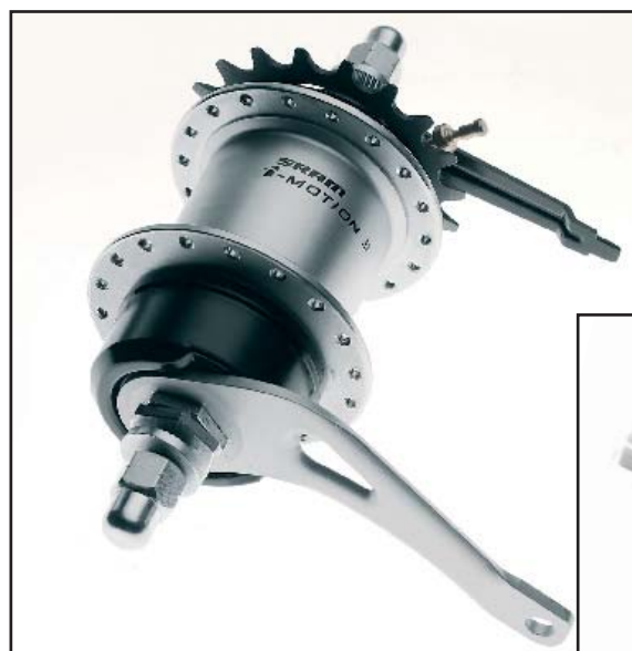
i-MOTION 3 coasterbrake hub