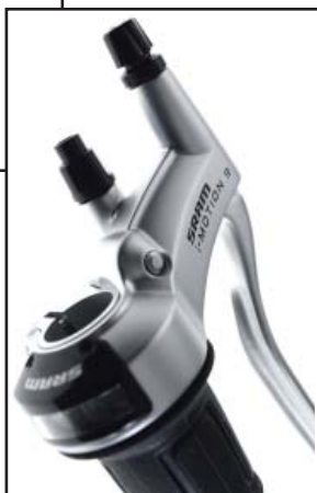
i-MOTION 9 IBS