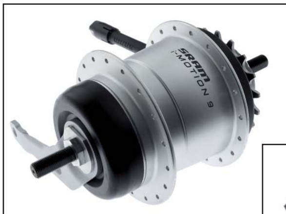
i-MOTION 9 coasterbrake hub