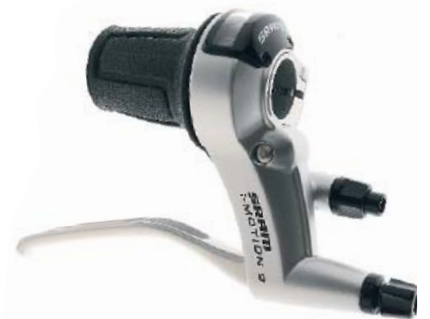
TRANSITION I-MOTION9 HUB